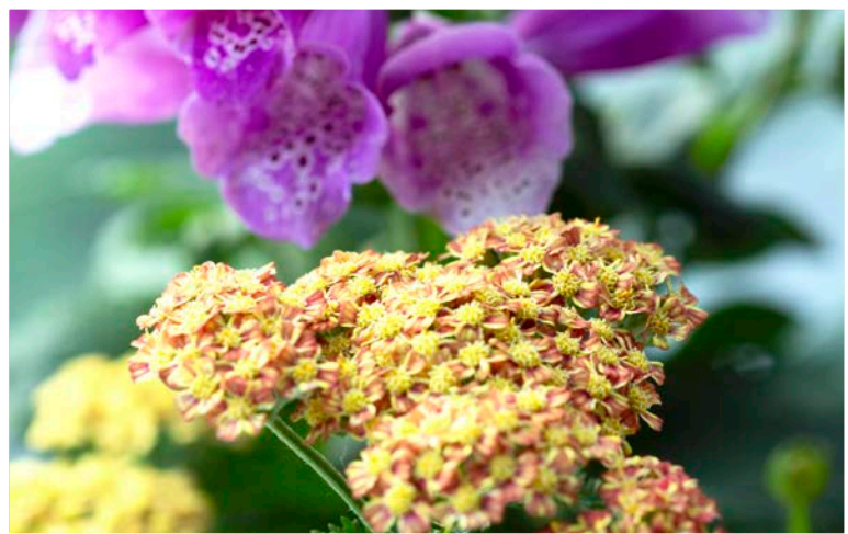
Mix and match from a variety of colors, shapes, and textures

More sun equals more flowers! All of the Perennials discussed here are for all-day sun, so you can feel free to mix and match. A little shade (like a couple of hours) is ok, but they need a lot of sun. There are many varieties to choose from in a range of sizes, colors, and textures. Spend some time initially planning your garden design—it's worth the investment. Do the work once with Perennials and you'll reap the rewards year after year.