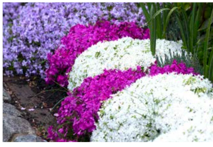
Colorful Creeping Phlox