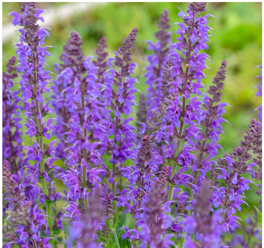
Does beautiful Salvia spike your interest?