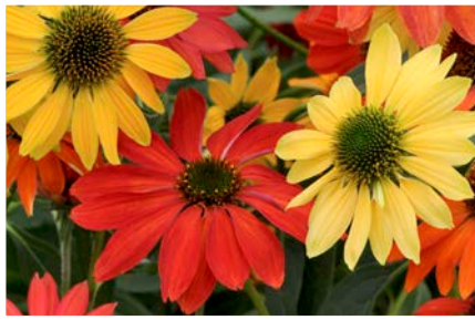
Echinacea in a mix of colors