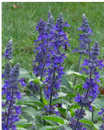
Intense blue spikes of Salvia

Salvia: Blue, violet-purple. Vibrant flower spikes attract butterflies to the garden. Tall & upright; great for cut flowers. · Height: 18-24 inches · Spread: 12-18 inches